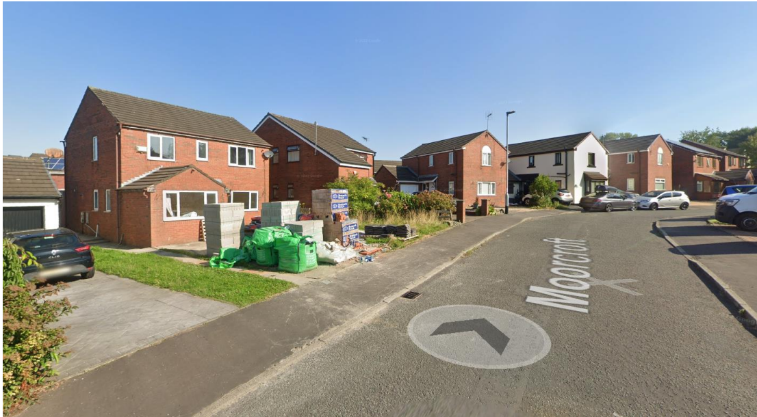
Google Street view image of application site – August 2022.