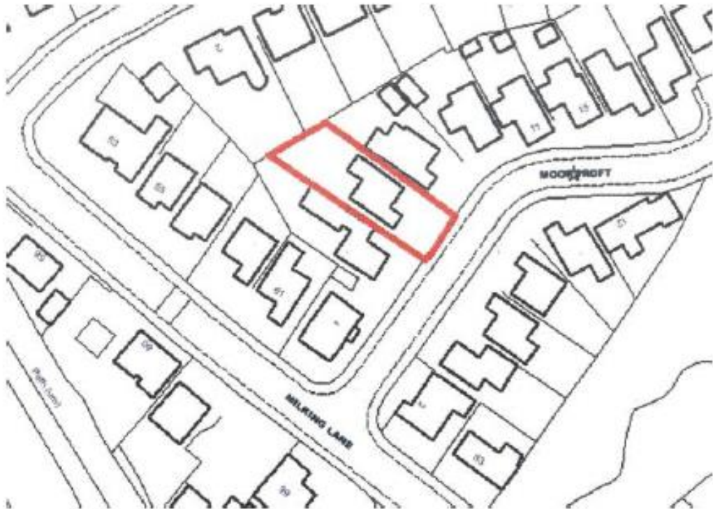
Supporting Statement, Gryffin House, 27 th Oct 2022.

3.1.3 The site is identified by the red edge location plan below and Google imagery.