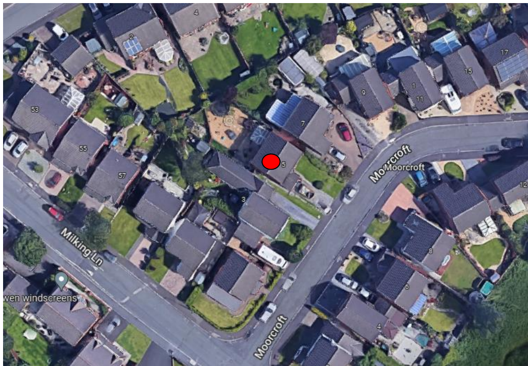
Google Imagery, August 2022